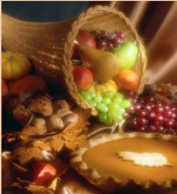
A Moment of Thanksgiving

The unthankful heart... discovers no mercies; but let the thankful heart sweep through the day and, as the magnet finds the iron, so it will find, in every hour, some heavenly blessings!